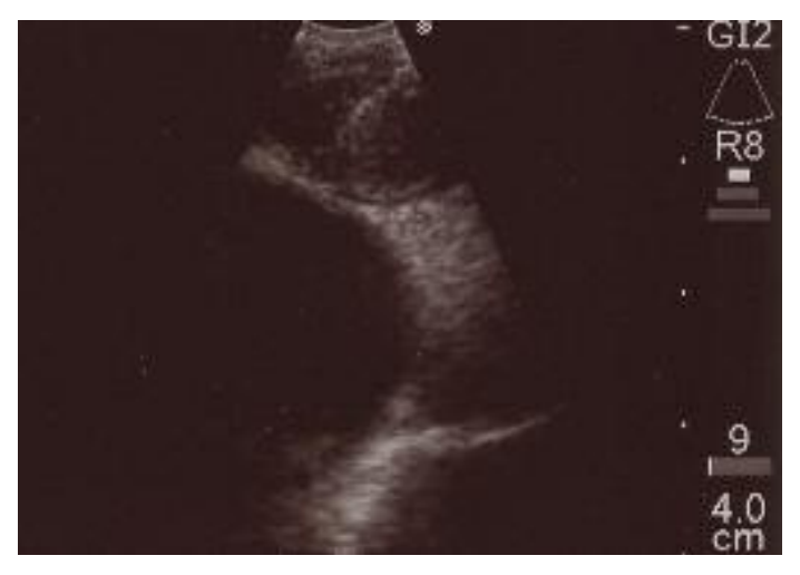
This EBUS-guided biopsy of a 1.2cm left paratracheal lymph node revealed adenocarcinoma of the lung.

"Proper staging is important because the survival rates for lung cancer vary widely by stage, and treatment is dictated by the stage of a patient's cancer," Nead said. "EUS and EBUS allow us to reach areas that are frequently missed by other techniques, or that would require a more extensive surgery to reach, such as the hilum. These endoscopes are terrific tools to add to the armamentarium of Pulmonary, GI, and Thoracic Surgery."