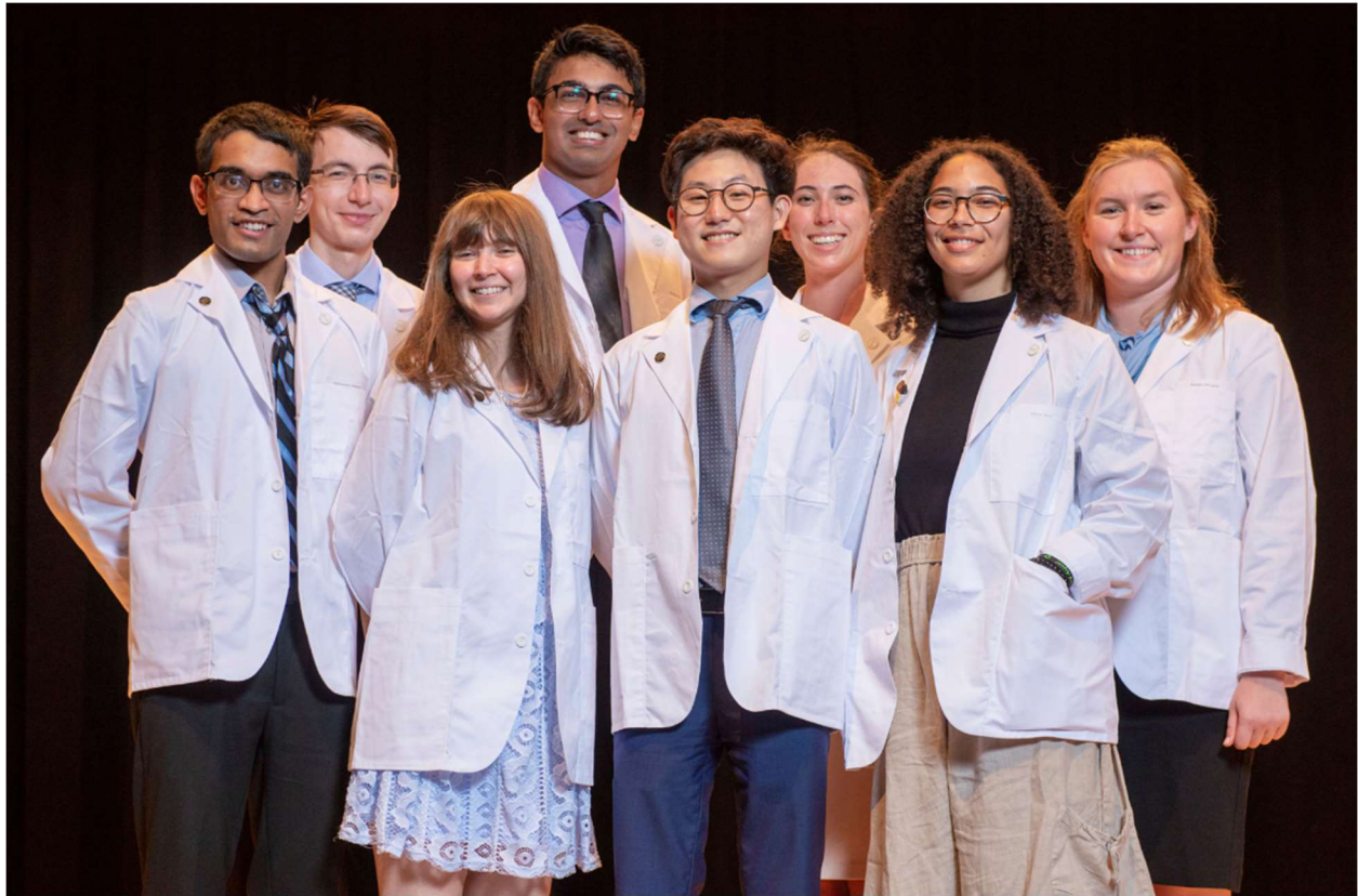
Matriculated class for Fall 2021 at the annual White Coat Ceremony, August 13, 2021